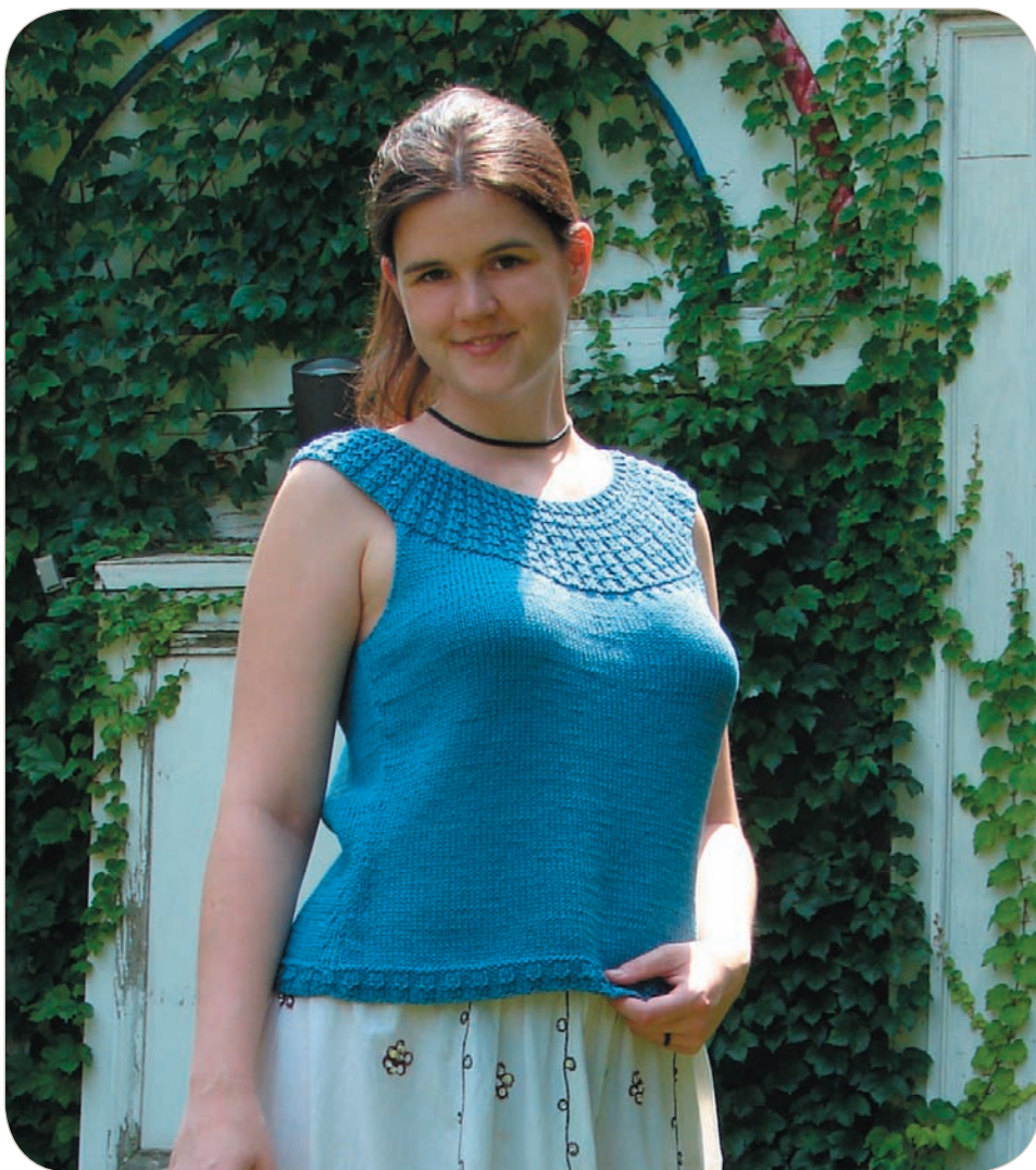
first published in Classic Elite's Web-Letter, Issue #4 classiceliteyarns.com